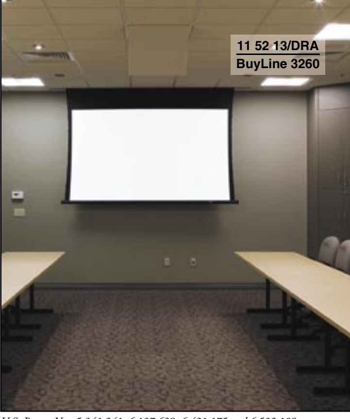
U.S. Patent Nos. 5,341,241, 6,137,629, 6,421,175 and 6,532,109. Other patents pending.

Access MultiView—Motorized screen and masking system in the same case for dual form at projection. Includes: a motorized projection screen, your choice of Series V or E, in HDTV or WideScreen format; a motorized, flat black mask on a second roller converts the screen to 4:3 NTSC video format by masking the sides of the viewing surface.